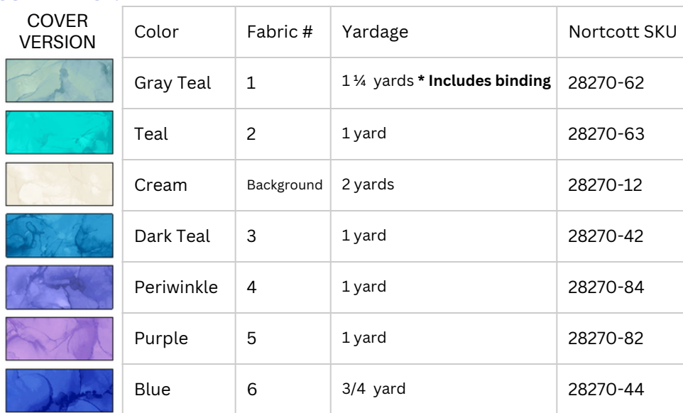
Alternate Color Version